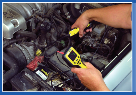
COP IGNITION SYSTEMS