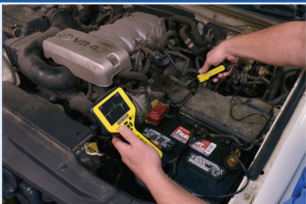
COP IGNITION SYSTEMS

SIP Main Unit COP. Pickup Paddle Adapter, Secondary Ignition Wire Adapter, and soft sided zipper pouch.