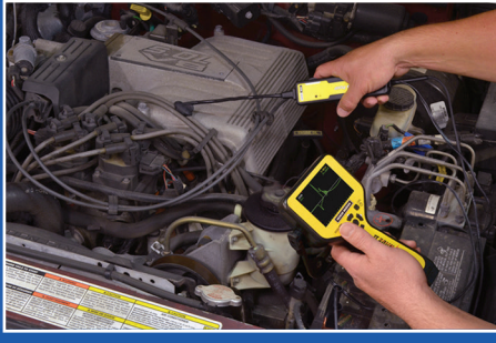
SECONDARY IGNITION WIRES