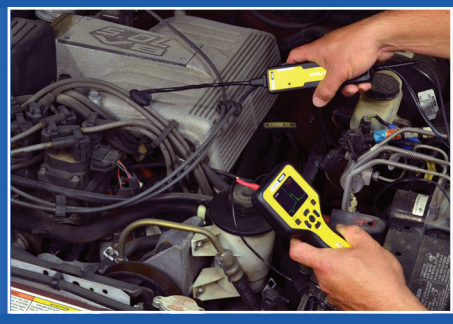
SECONDARY IGNITION WIRES